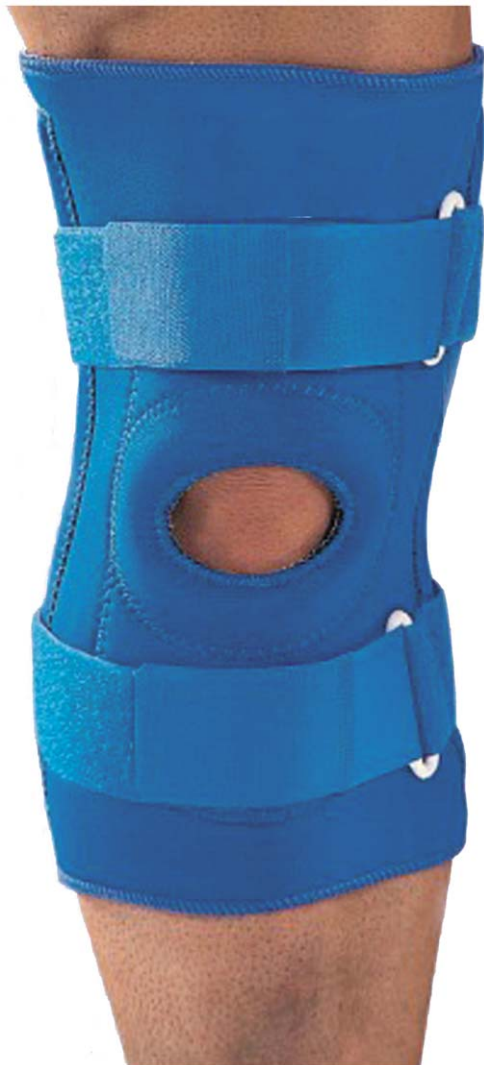
Figure 1. Neoprene knee sleeve with 4 metal supports. doi:10.1371/journal.pone.0050110.g001

Moreover, a prefabricated PKB (fabricated by a certified orthotist) which was designed according to the typical designs in conventional PKBs; the design and manufacture of the PKB was supervised and verified by the faculty members of the department of Orthotics and Prosthetics of Tehran University of Medical Sciences. It included thigh and calf plastic cuffs (Figure 2; A and D), with medial and lateral aluminum uprights (Figure 2; C) and polycentric knee hinges (Figure 2; B). The hinges let full range of